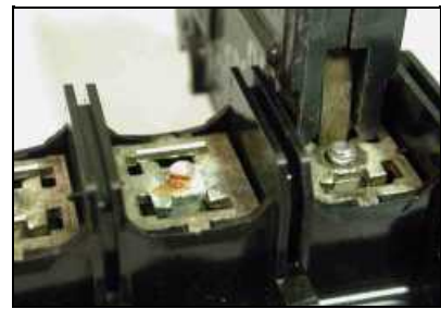
C. Stab socket on a post, attached with an 8-32 steel screw.