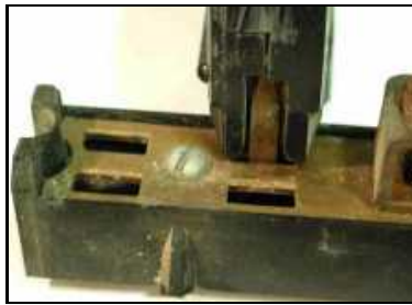
A. Copper buss bar with punched openings.

The "panel" is the unit within the enclosure, on which the breakers are mounted. The main electrical service feeders (electrically live, from the meter) are connected at the panel, and the panel has an internal conductor system that distributes the power to the individual circuit breakers. The internal conductor system consists essentially of "bussbars" (thick metal bars) that have sockets incorporated or attached, into which the breakers' "stab" contacts are inserted. There are many different types of bussbar constructions in FPE panels, three of which are shown in Figure 2.