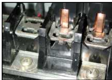
B. "Z" clip, clamped to bussbar with 10-32 screw.