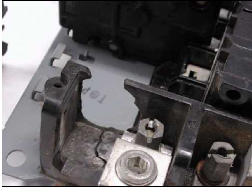
FIGURE 10 - THE DAMAGE TO THE INSULATING STRUCTURE OF THE PANEL (FIG. 8) IS MORE CLEARLY VISIBLE WITH THE BREAKER REMOVED.