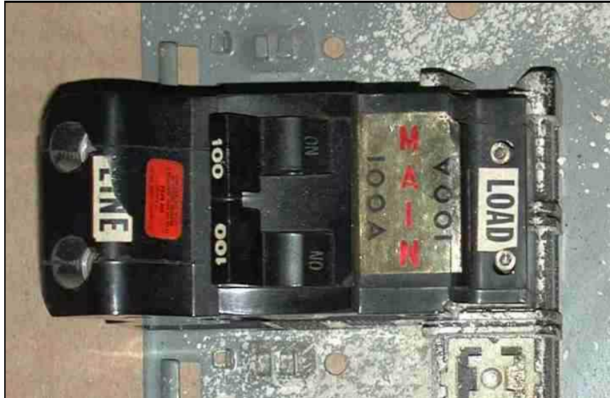
FIGURE 6 - FPE 100-AMP MAIN BREAKER CONNECTS TO THE BUSBARS THROUGH THE PLATE & POST CONFIGURATION, USING ONE SOCKET-HEAD 8-32 SCREW FOR EACH POLE TO ATTACH TO ITS CONTACT PLATE.

To put the diameter of the 8-32 screw in perspective, it is the same size as used on common receptacles for connecting #14 or #12 copper wire (for 15- and 20-amp circuits), with a diameter of only about 5/32". An FPE panel and main breaker of this type is shown in Figure 6. The main breaker's output terminal mounting screws and the tiny Allen-wrench that fits them are shown in Figure 7.