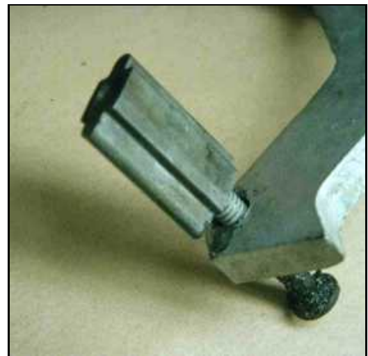
B. Bussbar, Screw, and Post