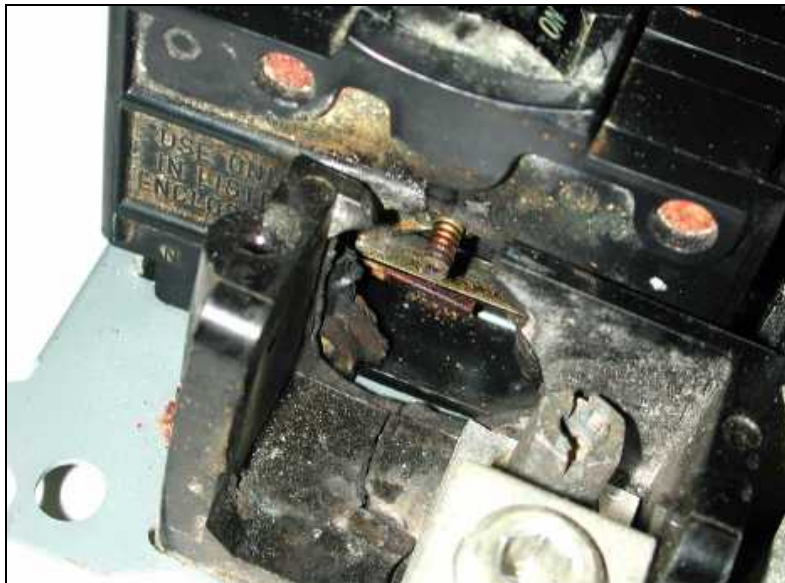
FIGURE 9 - VIEW DOWN TOWARD UPPER RIGHT OF PANEL SHOWN IN FIG. 8. THE FPE STAB-LOK® TWO-POLE 30-AMP BREAKER FED THE CLOTHES DRYER.

The main service cable connector has been rotated out of the way for better visibility of the damage. The plastic insulator is burnt and cracked. The breaker's internal mechanism can be seen through the hole burned through its side. Figures 10 and 11 show the damage to the separate items.