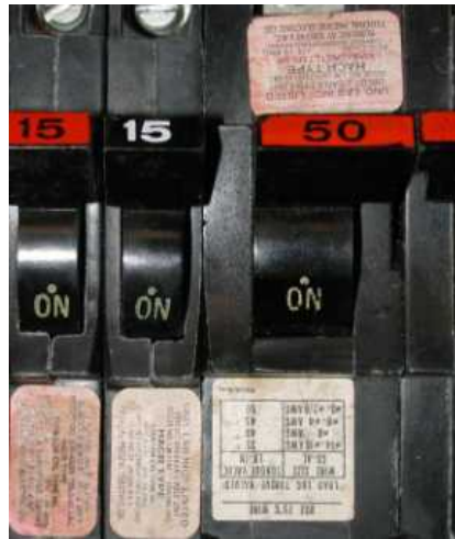
FIGURE 12 - FPE STAB-LOK ® BREAKERS WITH WHITE DOT ON TOGGLE (ABOVE “ON”) AND PINK LABEL