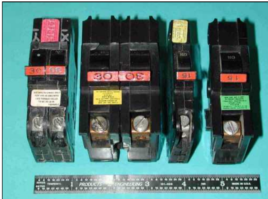
FIGURE 1 - REPRESENTATIVE SAMPLES OF HALF- AND FULL-WIDTH FPE STAB-LOK ® CIRCUIT BREAKERS (left to right: 1/2-width double pole, full-width double pole, 1/2-width single-pole, full width single-pole)

Details regarding both the FPE Stab-Lok ® circuit breaker and FPE panel performance problems are provided in the following sections.