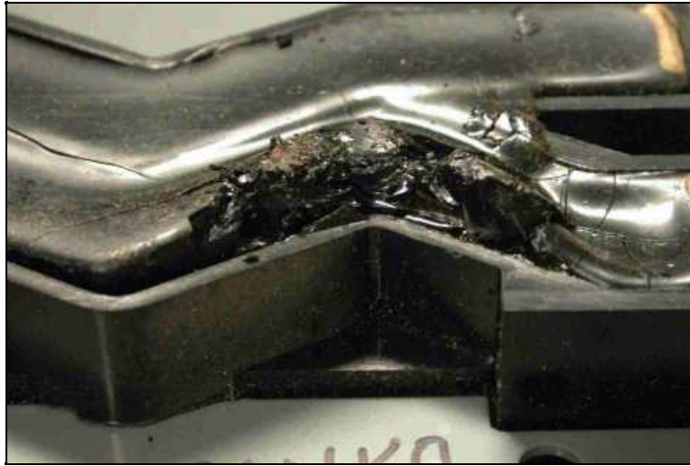
FIGURE 3 - OVERHEATING AT THE CONTACT BETWEEN THE BUSSBAR AND THE STAB SOCKET ASSEMBLY CAUSED THIS DAMAGE TO THE INSULATION.

(This view is of the backside of the panel. The damage cannot be seen unless the panel is taken out of the enclosure.)