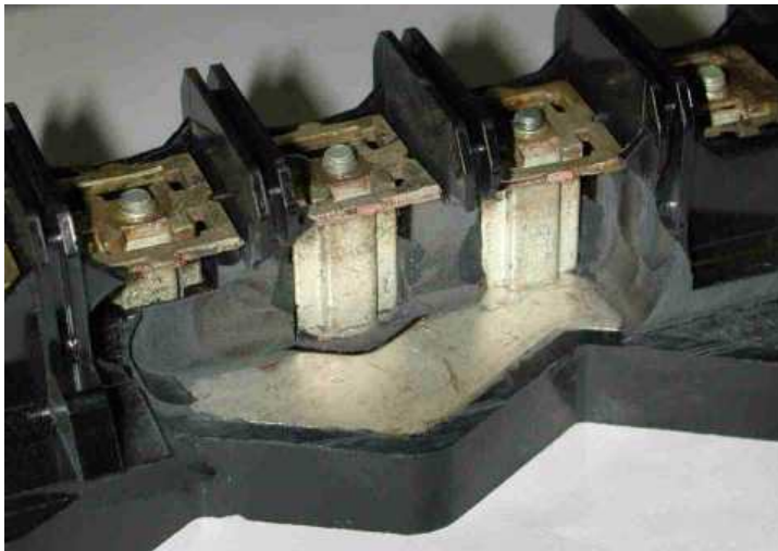
A. Cutaway - Bussbar, Post, and Stab Socket Plate.

A more serious failure of this type has been documented. 1 In that instance, the failure had been severe enough to ignite a smoldering fire on the plastic insulating material. The fundamental weakness in this design is the use of a single, relatively flimsy 8-32 screw to hold a structure together that can feed up to four half-width breakers with a total "ampacity" (rated circuit capacity) up to about 160 Amps. Figure 4 shows how the stab socket plate and post are attached to the busbar.