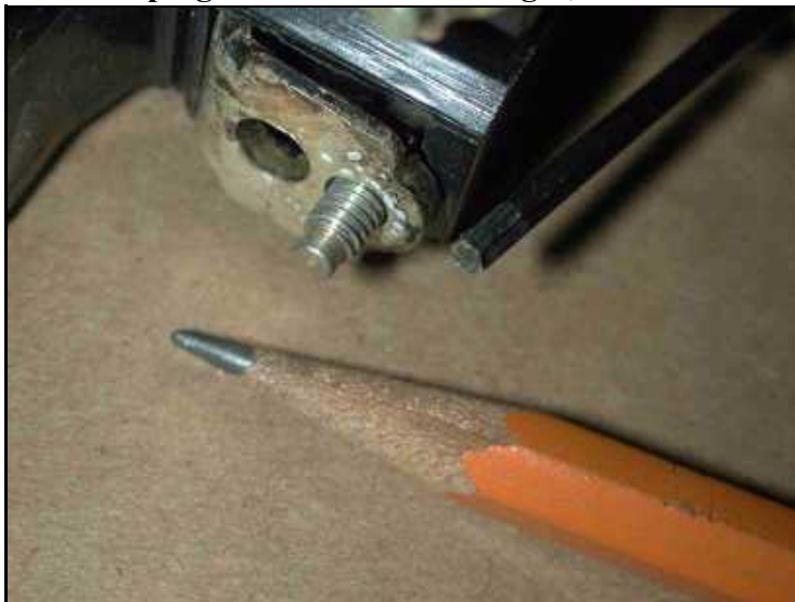
FIGURE 7 - ONE LOAD-SIDE CONTACT AND ITS 8-32 CLAMPING SCREW, ON THE FPE 100-AMP MAIN BREAKER OF FIG. 6. THE SCREW-HEAD TAKES A 3/32" ALLEN WRENCH, WHICH IS ONLY SLIGHTLY LARGER THAN THE LEAD OF THE PENCIL.

(The heads of the 8-32 clamping screws are seen at right, above and below the "LOAD" label.)