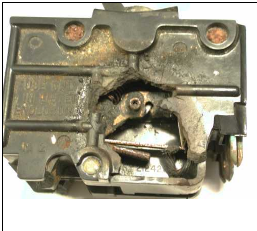
FIGURE 11 - THE FAILED FPE STAB-LOK® DRYER BREAKER (UPPER RIGHT, FIG. 8)